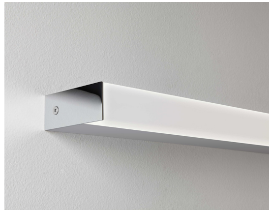
CODE: 1322011 FINISH: POLISHED CHROME

TO MAINTAIN THIS PRODUCT TO ITS BEST CONDITION, PLEASE VIEW OUR CARE AND CLEANING GUIDE ON THE SUPPORT SECTION OF THE ASTRO WEBSITE.