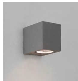
CODE: 1310007 (8195) FINISH: TEXTURED GREY

THIS PRODUCT IS SUITABLE FOR ONEROUS ENVIRONMENTS AND CAN BE INSTALLED WITHIN FIVE MILES OF THE COAST - THREE YEAR WARRANTY APPLIES.