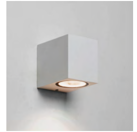
CODE: 1310005 (7564) FINISH: TEXTURED WHITE