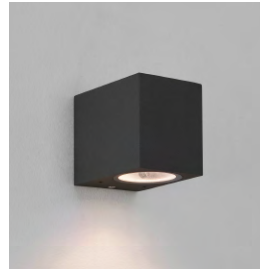
CODE: 1310002 (7126) FINISH: TEXTURED BLACK