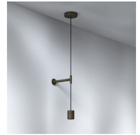
CODE: 1184011 FINISH: BRONZE

TO MAINTAIN THIS PRODUCT TO ITS BEST CONDITION, PLEASE VIEW OUR CARE AND CLEANING GUIDE ON THE SUPPORT SECTION OF THE ASTRO WEBSITE.