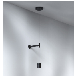
CODE: 1184009 FINISH: MATT BLACK