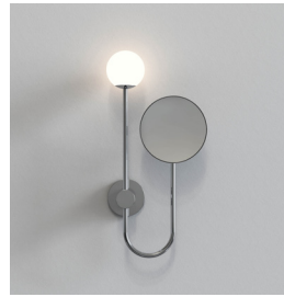
CODE: 1424001 FINISH: POLISHED CHROME