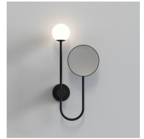
CODE: 1424003 FINISH: MATT BLACK

TO MAINTAIN THIS PRODUCT TO ITS BEST CONDITION, PLEASE VIEW OUR CARE AND CLEANING GUIDE ON THE SUPPORT SECTION OF THE ASTRO WEBSITE.