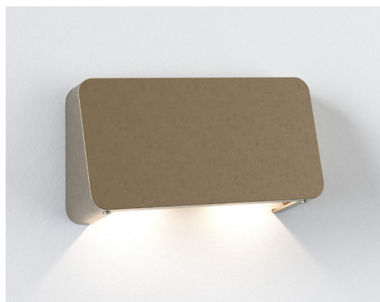
CODE: 1419004 FINISH: COASTAL BRASS

THIS PRODUCT IS SUITABLE FOR USE BY THE COAST AND OTHER ONEROUS ENVIRONMENTS - TEN YEAR WARRANTY APPLIES, EXCEPT WHEN THE PRODUCT HAS AN INTEGRAL LED AND/OR DRIVER IN WHICH CASE, A THREE YEAR WARRANTY APPLIES. FOR FURTHER WARRANTY INFORMATION PLEASE REFER BACK TO THE ORIGINAL POINT OF PURCHASE.