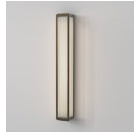
CODE: 1370005 (8331) FINISH: BRONZE

TO MAINTAIN THIS PRODUCT TO ITS BEST CONDITION, PLEASE VIEW OUR CARE AND CLEANING GUIDE ON THE SUPPORT SECTION OF THE ASTRO WEBSITE.