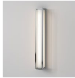
CODE: 1370003 (8329) FINISH: POLISHED CHROME