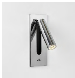
CODE: 1215035 (8102) FINISH: POLISHED CHROME