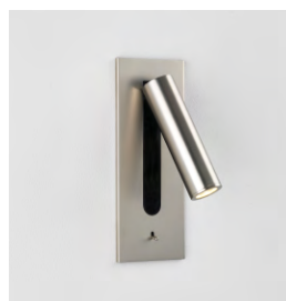
CODE: 1215039 (8105) FINISH: MATT NICKEL

TO MAINTAIN THIS PRODUCT TO ITS BEST CONDITION, PLEASE VIEW OUR CARE AND CLEANING GUIDE ON THE SUPPORT SECTION OF THE ASTRO WEBSITE.