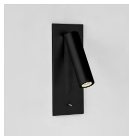
CODE: 1215037 (8104) FINISH: MATT BLACK