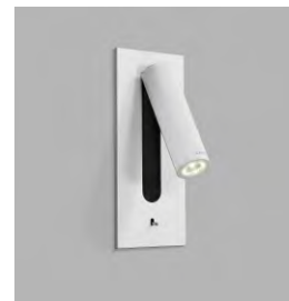
CODE: 1215036 (8103) FINISH: MATT WHITE