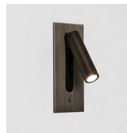
CODE: 1215038 (8105) FINISH: BRONZE