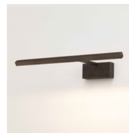
CODE: 1374018 FINISH: BRONZE

TO MAINTAIN THIS PRODUCT TO ITS BEST CONDITION, PLEASE VIEW OUR CARE AND CLEANING GUIDE ON THE SUPPORT SECTION OF THE ASTRO WEBSITE.