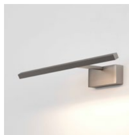
CODE: 1374001 FINISH: MATT NICKEL